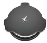
SLP Scope Lens Protector