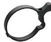
TL Throw Lever