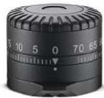
BTF Ballistic Turret Flex